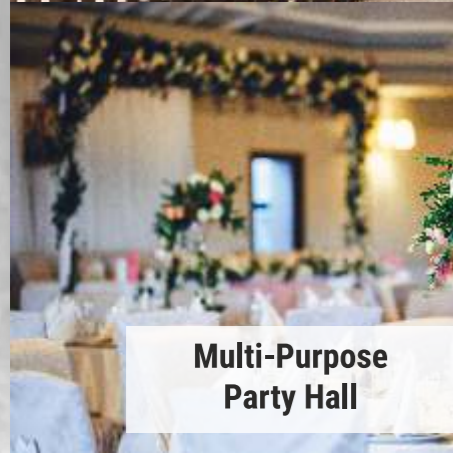
Multi-Purpose Party Hall