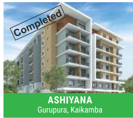
ASHIYANA Gurupura, Kaikamba