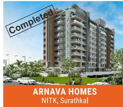
ARNAVA HOMES NITK, Surathkal