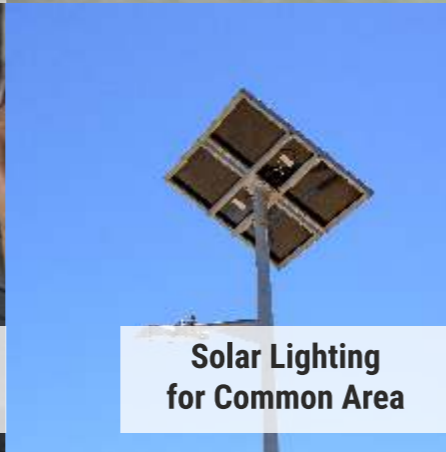
Solar Lighting for Common Area