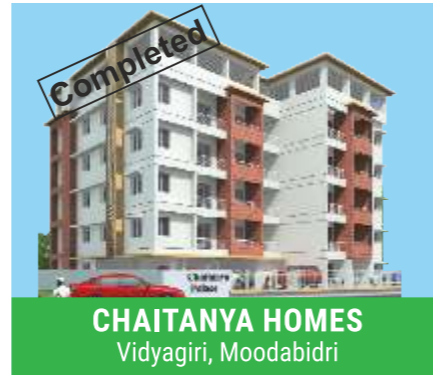
CHAITANYA HOMES Vidyagiri, Moodabidri