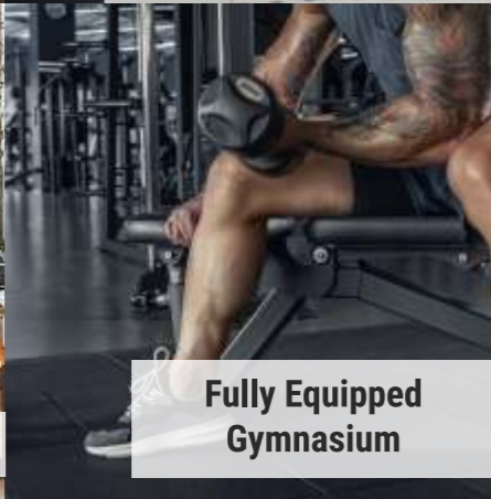
Fully Equipped Gymnasium