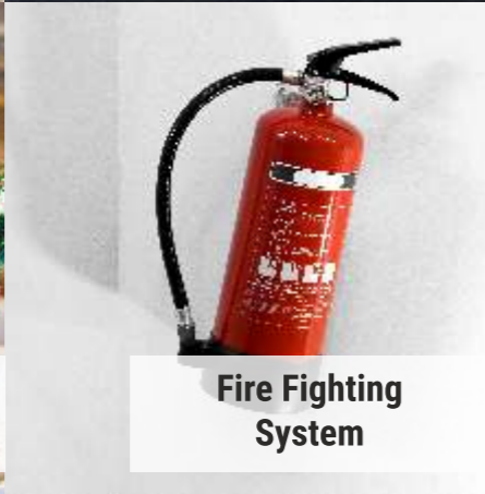
Fire Fighting System